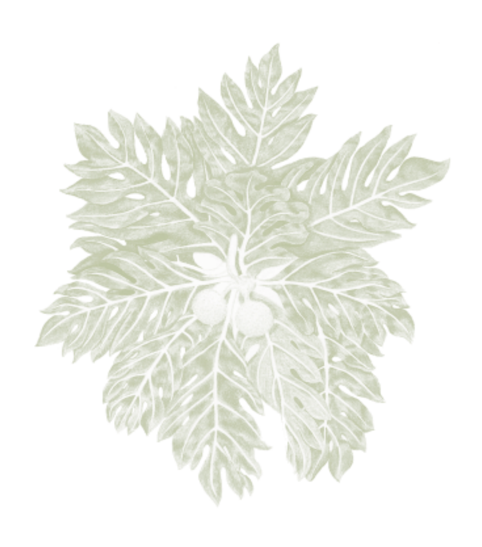
Department of Hawaiian Home Lands State of Hawai'i August 2000